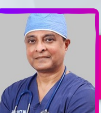
TVS GOPAL Axon Anaesthesia Associates